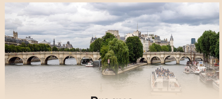
Prague May 21 - 25, 2024 · Starting at $900*

MAY 21 – DEPART THE USA Board your overnight flight to Prague